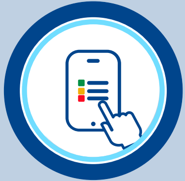
CHECK APP FOR CUSTOMS STATUS