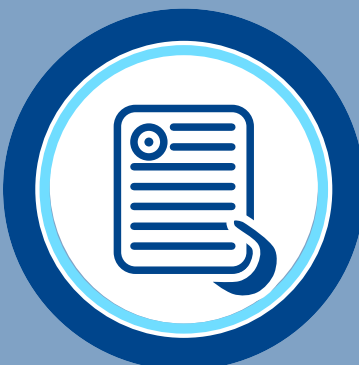
STANDARD DOCS - CMR, ONU, ETC.