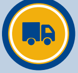
ORANGE CUSTOMS STATUS